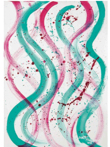
Sarit Lichtenstein, "Amor Puro", 2018, acrylic on canvas, 90 x 70 cm.

For the exhibition the gallery AM PARK chose the title "Sarit Lichtenstein – Amor Puro" referring to the painting of the same name from 2018. The exhibition is planned as a travelling exhibition and will be shown in various institutions and museums in Mexico, including the Casa de Coahuila in Mexico City.