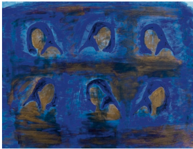
Sarit Lichtenstein, "Autorretrato", 2006, blue and gold pigments on paper, 50 x 66 cm

She was born in 1961 in Mexico City, and studied from 1980 to 1984 at the Instituto Nacional de Bellas Artes of Mexico; between 1984 and 1986 she then continued her studies in Rome, Italy, at the Istituto Europeo di Design, and in Jerusalem, Israel, at the Bezalel Art Academy from 1988 to 1990.